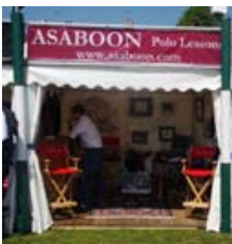
3m x 3m stand with wooden floor and banner rail.

To exhibit at this event, simply complete the attached booking form and return it by post or email, or you are welcome to just call your order in on 01798 215 007.